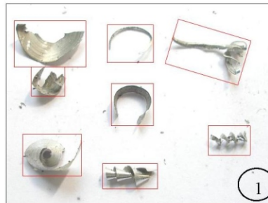
By curvilinear method