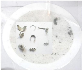
Common C type chips & loops